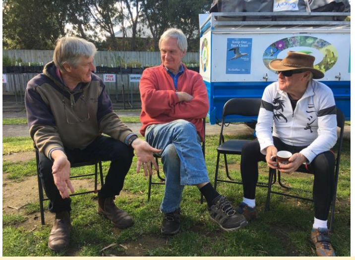
Nursery and planting volunteers at the post planting BBQ